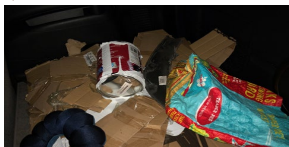
Paint and cardboard in a vehicle on deck 5 of cargo ship, taken in June 2020, provided by the Coast Guard.