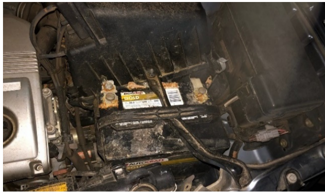
Heavily corroded battery with terminals still connected found in vehicle on Ro-Ro, taken in June 2020, provided by the Coast Guard.

Because the vessel had previously loaded vehicles in multiple ports across the country, it became evident that the hazardous conditions onboard this vessel were not limited to a single Captain of the Port (COTP) zone. Within three months of the aforementioned incident, a similar Ro-Ro vessel suffered a vehicle fire onboard while in the Sector Jacksonville's area of responsibility. Although this fire was not as severe as the incident in June of this year, it is likely due to the same contributing factors based on initial findings.