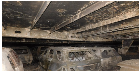
Cargo and structural fire damage on deck 8 of a cargo ship, taken in June 2020 provided by the Coast Guard.