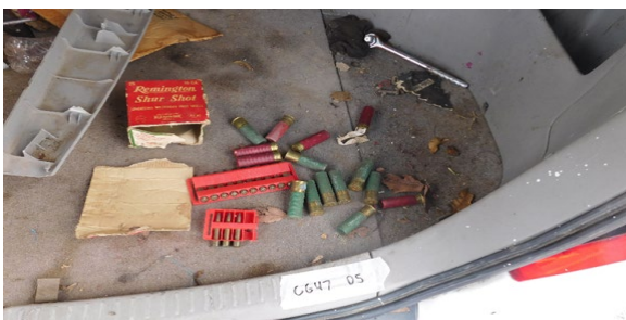
Ammunition found in trunk of vehicle from deck 5 of cargo ship, taken in June 2020, provided by the Coast Guard.

As the Coast Guard investigation began, several causal factors were identified. These causal factors included: vehicles leaking fluids, personal goods and combustibles stored within vehicles, and the failure to protect batteries from short circuiting. Coast Guard Investigators discovered numerous vehicles throughout the vessel not in compliance with the requirements onboard.